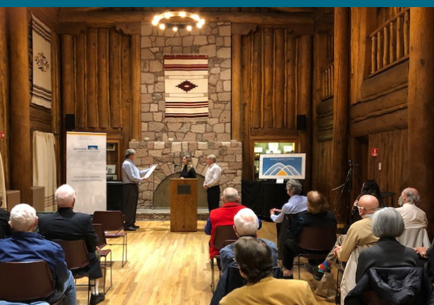
Celebrating Donors and Supporters during National Philanthropy Week