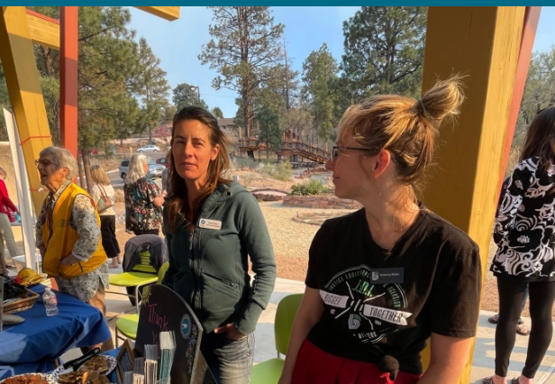
Celebrating Community Volunteerism during National Volunteer Week